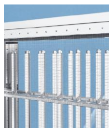
Electrodeless Fluorescent tube