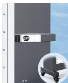
Wheels and grip