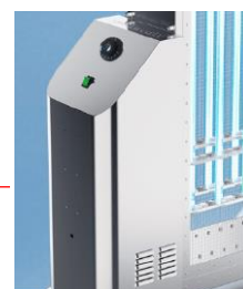
0~120 min timer